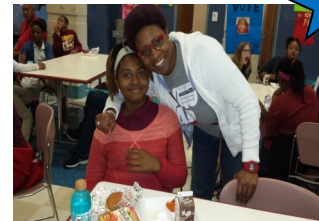
Parents even enjoyed the school's lunch with their student.