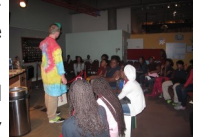
By Serinity Merritt (6th Gr.)